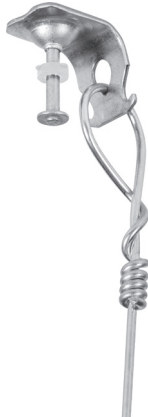
X-CX C27 Fastener with pre-tied ceiling wire