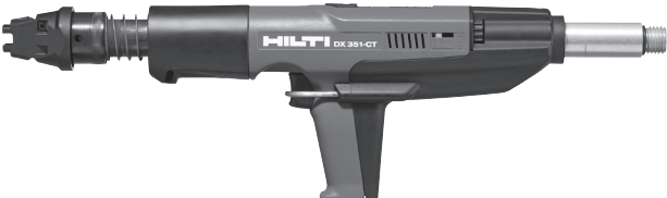
DX 351-CT Powder-Actuated Tool