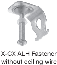
X-CX ALH Fastener without ceiling wire