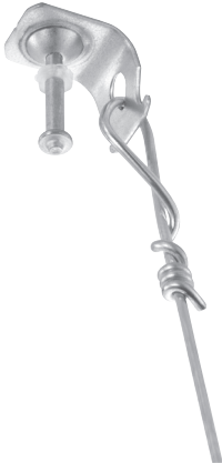
X-CX ALH Fastener with pre-tied ceiling wire