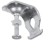
X-CX C27 Fastener without ceiling wire